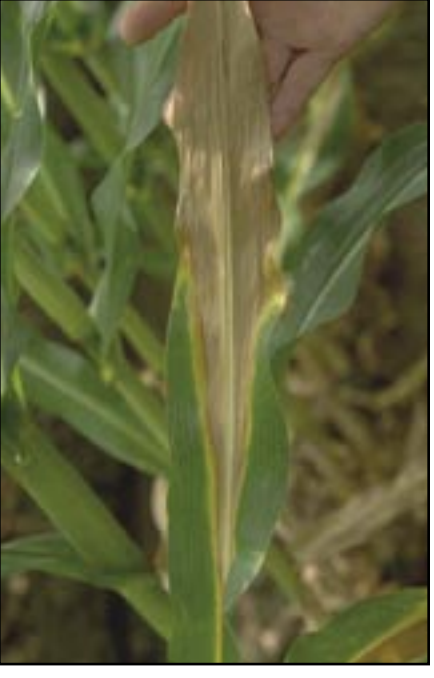
Nitrogen deficiency in corn. Appearing first on older leaves, yellowing starts at leaf tip and moves towards the base in a "V" pattern down the midrib.